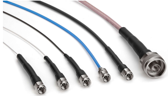
Figure 11: Microwave Coax Cables